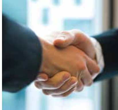
COMPLETE CONTRACTS – individual complete solutions on request.