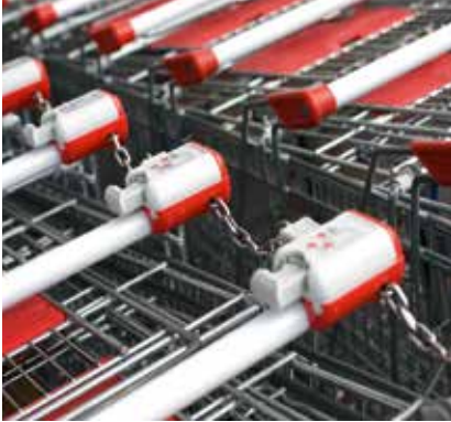
TOTAL TROLLEY MANAGEMENT – efficient and sustainable management for large shopping trolley fleets.

From the maintenance contract to the comprehensive package for all-round peace of mind