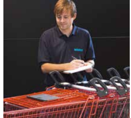
MAINTENANCE CONTRACTS – guarantee you shopping trolleys that always work perfectly and look great.