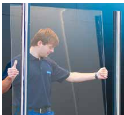
WANZL QUALITY PRODUCTS ARE ONLY INSTALLED AND COMMISSIONED by qualified specialist personnel.

Professional assembly to ensure successful use