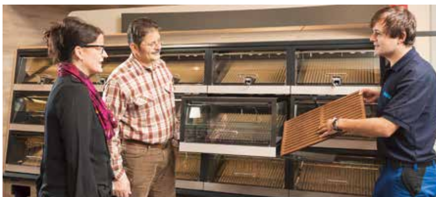
EVEN ONCE INSTALLATION HAS BEEN SUCCESSFULLY COMPLETED , Wanzl is still there for you. With our specialist, practical advice, your staff will always be equipped to use our products efficiently and correctly.