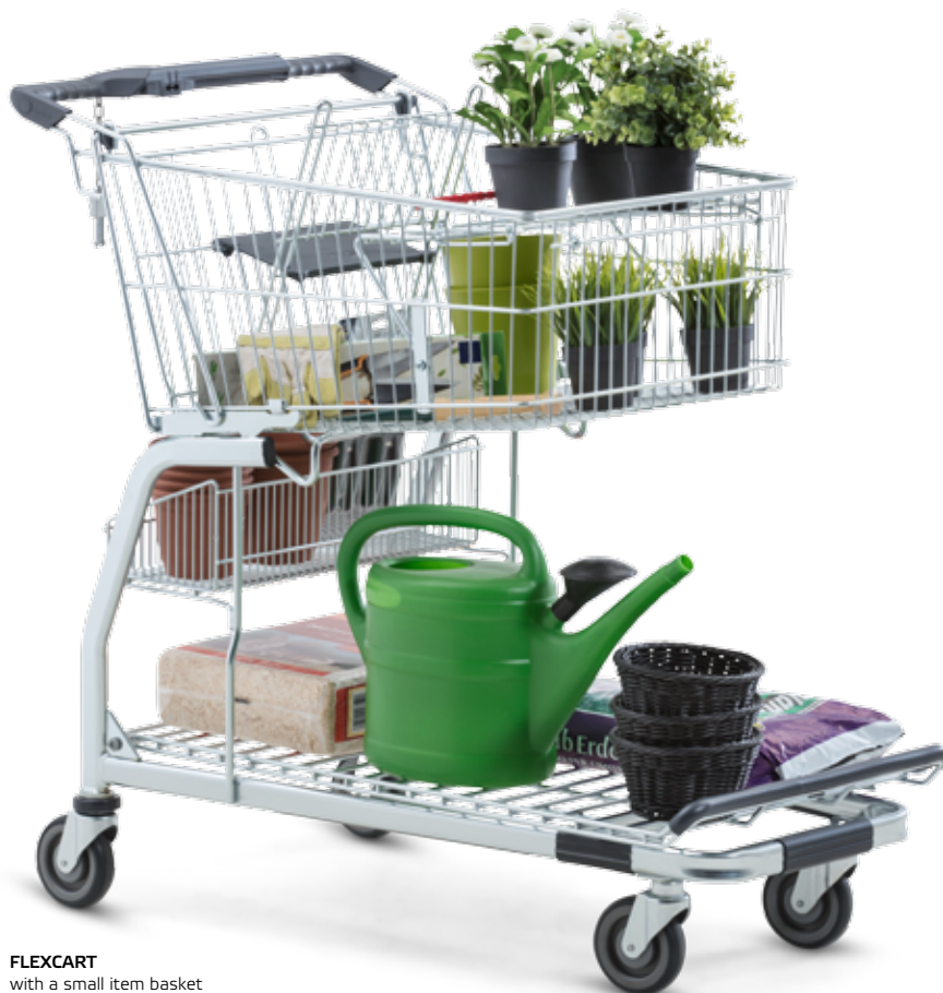
FLEXCART with a small item basket