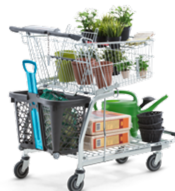
FLEXCART with GT40 eco adapter