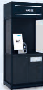
SCO MODULE WIRE TECH 100 1000x600x2400, inc. superstructure Art. no. 37.59779.95-0001 SCO checkout terminal Art. no. 98.78957.00-0000