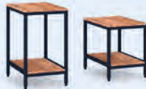
YOURTABLE T.02 665x465x550 Art. no. 04.16382.95-7097 665x465x750 Item no. 04.16383.95-7097