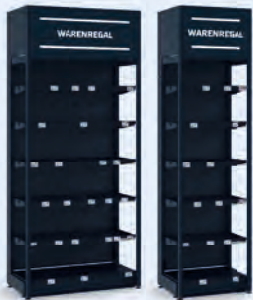
PRODUCT SHELF with 5 wire shelves incl. superstructure 1000x400x2400 Art. no. 04.16389.95-0001 625x400x2400 Art. no. 04.16388.95-0001