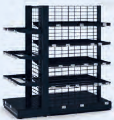
DISPLAY GONDOLA + GONDOLA HEAD 1000x400x1600 with 4 wire shelves each Item no. 04.16380.95-7097