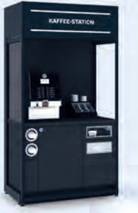
COFFEE STATION 1250x600x2400 excl. coffee machine Art. no. 37.59778.95-0001