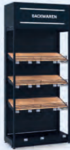
BAKED GOODS DISPLAY 1000x400x2400 with 3 wooden shelves Art. no. 04.16386.95-0001