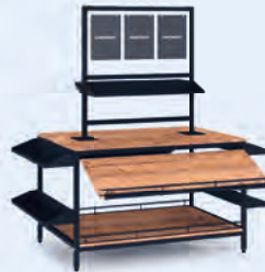
YOURTABLE T.01 with advertising board for attachment 1265x865x750 Art. no. 04.16381.95-7097