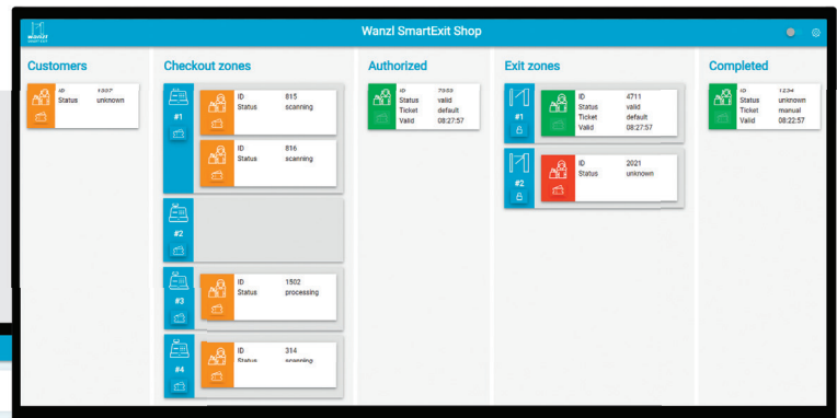
↑ WANZL BASIC SOFTWARE