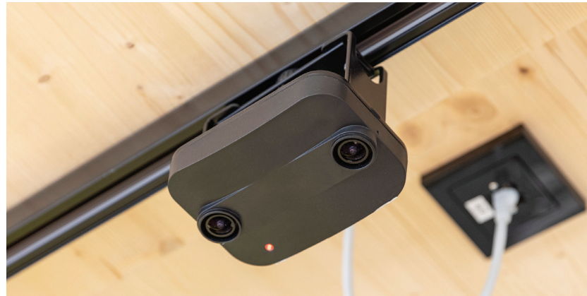
↑ INTELLIGENT SENSORS AND AI monitor the checkout area

Wanzl AI sensors assign anonymous ID's, monitor, verify, and manage processes in the SCO area, making shopping as convenient as it is safe. After paying at the SCO terminal, customers leave the store via the exit gate. No need to scan receipts, Smart Exit communicates with all Wanzl exit gates to open the exit gate automatically.